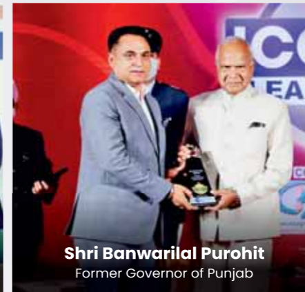
Shri Banwarilal Purohit Former Governor of Punjab