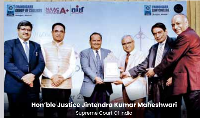
Hon'ble Justice Jintendra Kumar Maheshwari Supreme Court Of India