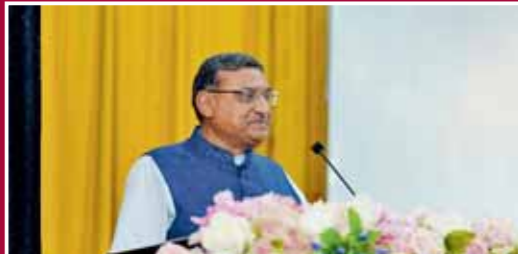
SHRI RAJDEEPAK RASTOGI (SR. ADVOCATE AND ADDITIONAL SOLICITOR GENERAL OF INDIA)