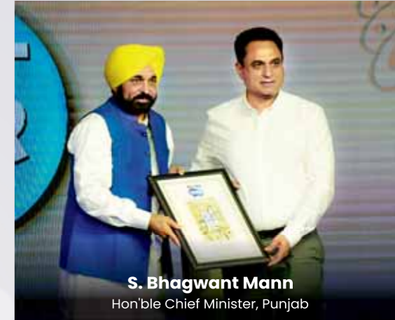
S. Bhagwant Mann Hon'ble Chief Minister, Punjab