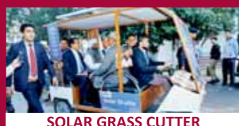
SOLAR GRASS CUTTER