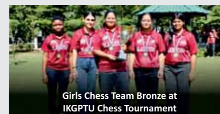
Girls Chess Team Bronze at IKGPTU Chess Tournament