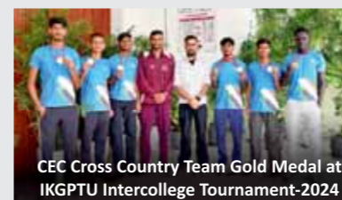
CEC Cross Country Team Gold Medal at IKGPTU Intercollege Tournament-2024