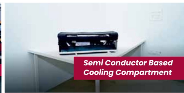
Semi Conductor Based Cooling Compartment