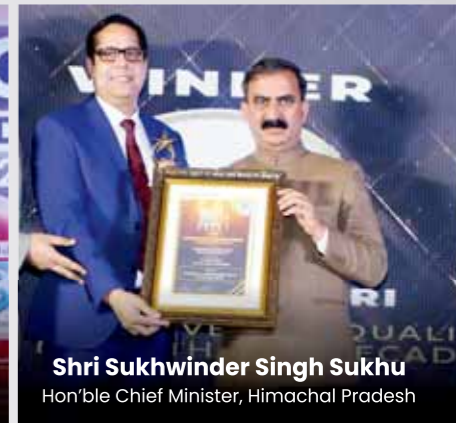
Shri Sukhwinder Singh Sukhu Hon'ble Chief Minister, Himachal Pradesh