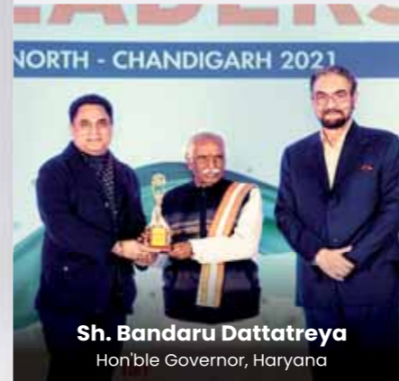
Sh. Bandaru Dattatreya Hon'ble Governor, Haryana