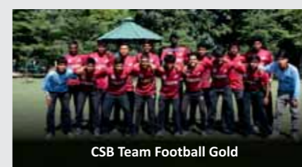
CSB Team Football Gold