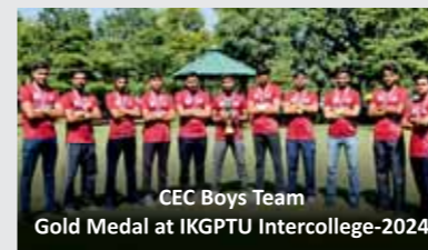
CEC Boys Team Gold Medal at IKGPTU Intercollege-2024