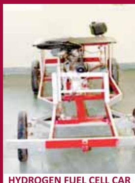
HYDROGEN FUEL CELL CAR

CGC Jhanjeri is dedicated to advancing research by providing comprehensive financial support with an annual budget of 15Cr. The institution fully funds all research-related expenses, including presentations and publications, leading to the impressive achievement of more than 1300 published research papers in SCI/SCIE/ESCI/SCOPUS/ABDC/WOS/UGC Care indexed journals. Furthermore, our student-friendly patent policy facilitates the development and filing of patents, with the college covering all associated costs. Over the past few years, we have submitted more than 2000 patent applications, leading to 608+ published patents that benefits inventors, students, and faculty alike.