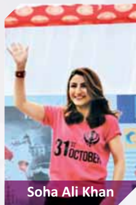
Soha Ali Khan