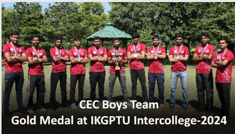
CEC Boys Team Gold Medal at IKGPTU Intercollege-2024