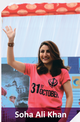
Soha Ali Khan