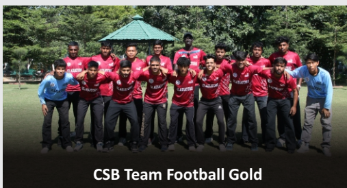
CSB Team Football Gold