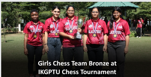
Girls Chess Team Bronze at IKGPTU Chess Tournament