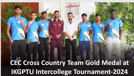
CEC Cross Country Team Gold Medal at IKGPTU Intercollege Tournament-2024