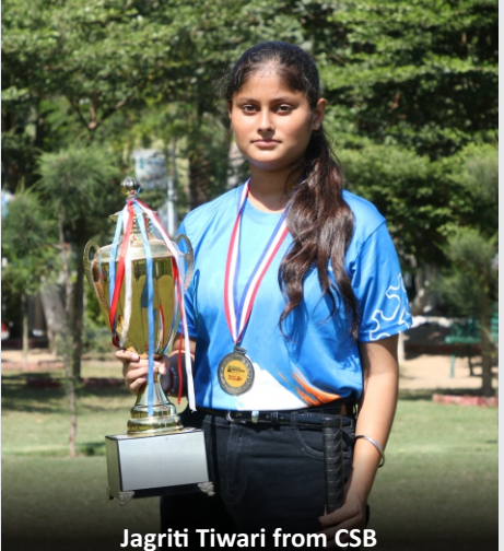
Silver in Asian Samurai Game-2024